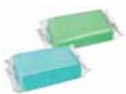
I-Tack: Dust removal wipe